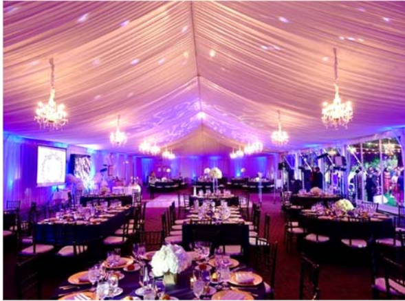
Moonlight Grove Tent