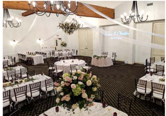
Clubhouse Banquet Room