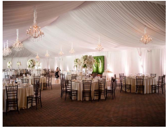
Moonlight Grove Tent