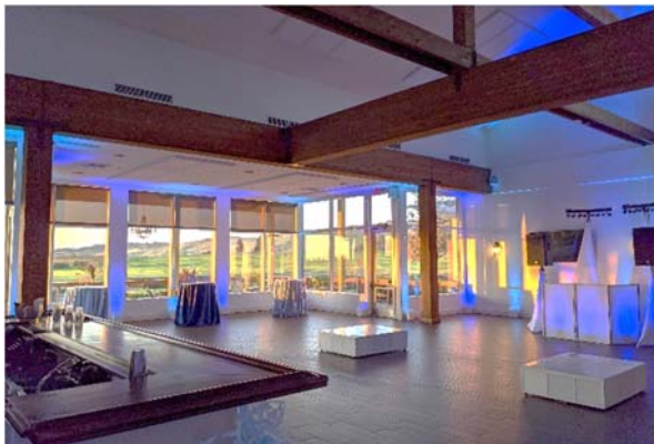
Clubhouse View Room