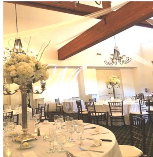
Clubhouse Banquet Room