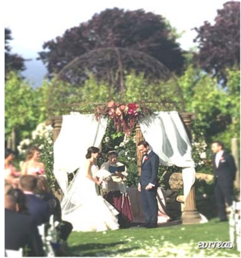
Moonlight Grove Ceremony