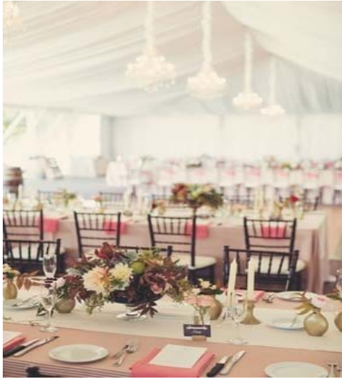
Moonlight Grove Tent