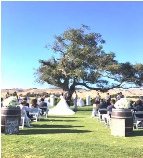
Oak Tree Ceremony