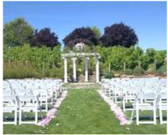
Moonlight Grove Ceremony