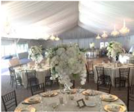
Moonlight Grove Tent