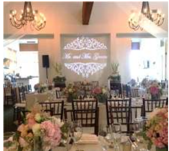
Clubhouse Banquet Room