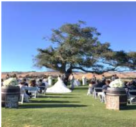
Oak Tree Ceremony