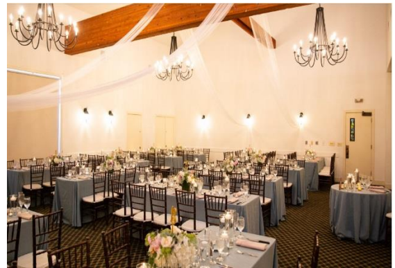
Clubhouse Banquet Room