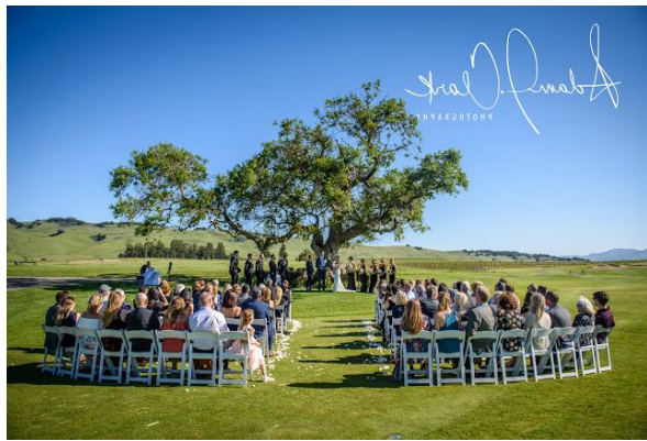
Oak Tree Ceremony