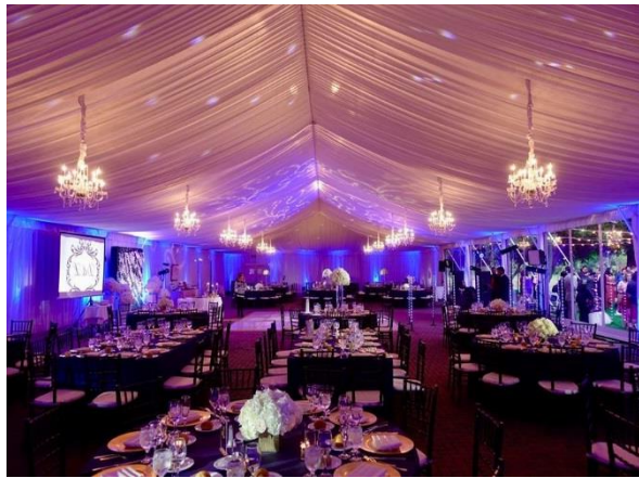
Moonlight Grove Tent